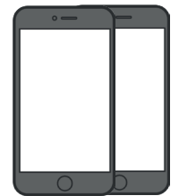
250 proprietary devices